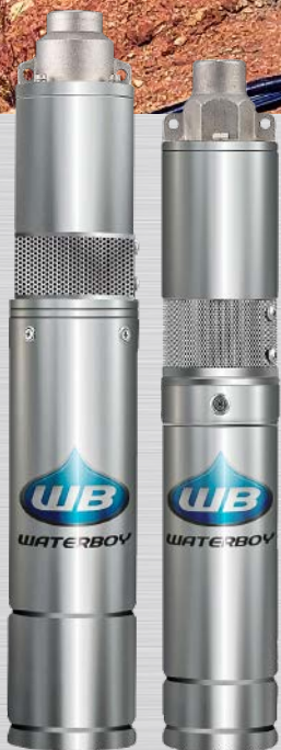
Pump, motor, controller