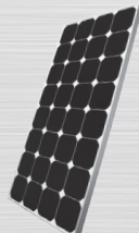
Mono Crystalline Solar Panels