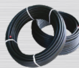
Power Cable Low Water Probe & Safety Cabling